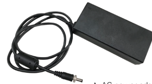
▲ AC power adapter (for MPC102-845-J)