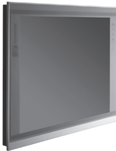
▲ Ultra-slim mechanism design