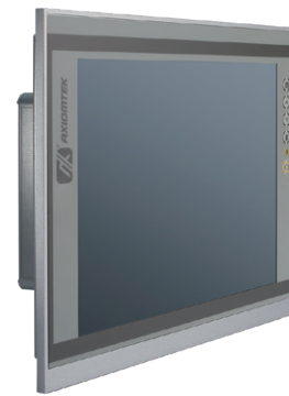
▲ Ultra-slim mechanism design