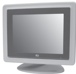
▲ Desktop stand