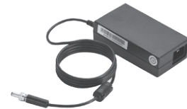
▲ AC power adapter (GOT5152T-834-J)