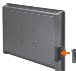
▲ CFAST™ slot with protective cover