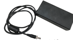
▲ AC power adapter (for GOT115-319)