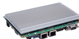
▲ Assembly view