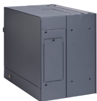
▲ Rear view