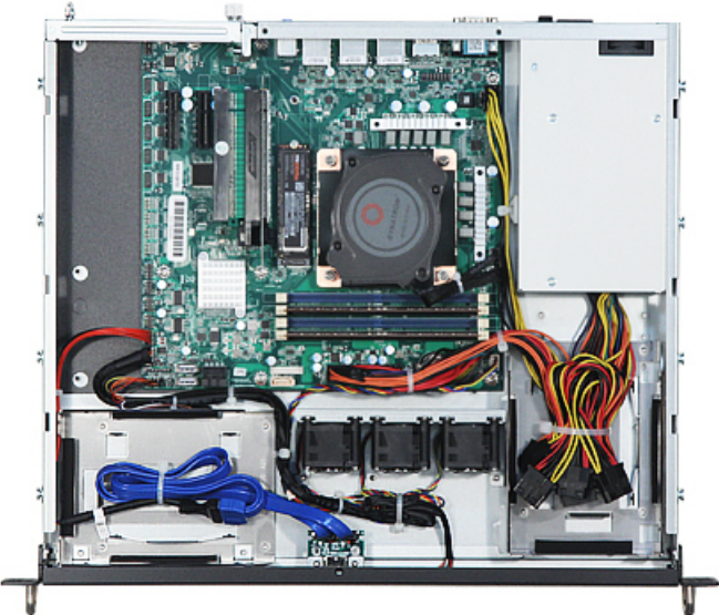
(Power supply is optional. Motherboard is not included.)